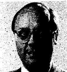
John D. Graham Center Director